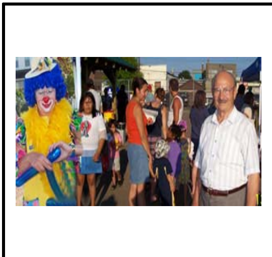
The Giant Block Party-Neighbourhood fun!